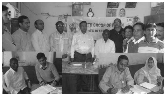
Ayurvedic health check-up camp in progress.

and Ayurved School, Patan, wherein 608 people were examined for various diseases and necessary advice and seven days medicines given.