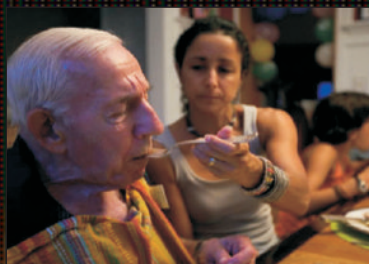
Love & Care