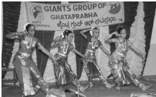
Children performing during Children's Day programme.

in association with Maa Amrutanandamai Mission Trust. Many dignitaries delivered talks on 'Importance of cleanliness'. * Many Awards & appreciation Certificates were bagged by the Group at Unit as well as Federation level for excellence in their Group activities during the year.