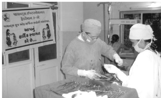
Doctors operating a patient.