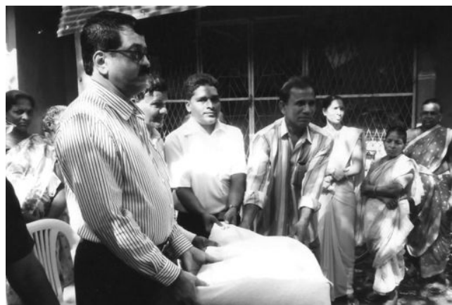
Seeds & fertilizer distribution project in progress.

& Winners were awarded prizes. * Financial assistance was provided to boys of S. T. communities to purchase Cricket kit etc. to take part in Tennis Ball