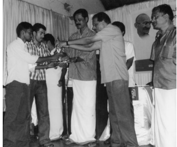
Dignitaries distributing prizes to Winners.

Mega quiz competition was conducted in a local High School and Winners were awarded prizes.