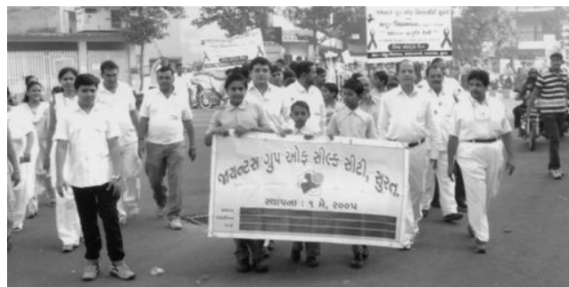
AIDS awareness rally in progress.