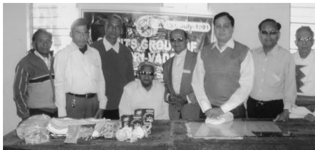
Distribution of household articles.

and biscuits were distributed to inmates of a mentally retarded home. * They continued with their Orthopaedic equipments distribution project for needy patients on a deposit basis. Four patients benefited during the month.