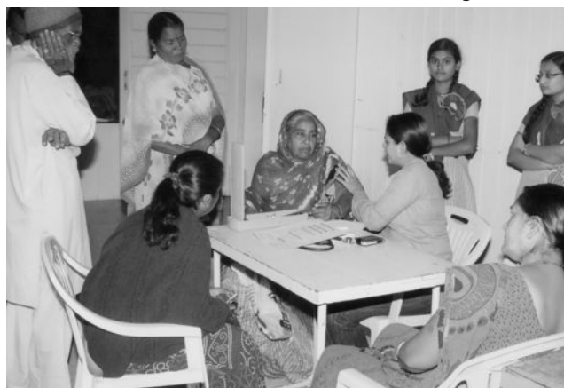
Ayurvedic health checkup camp in progress.

month of November, 2011. * Ayurvedic health checkup camp was held, wherein 200 patients were examined for Blood pressure, diabetes, skin diseases, hair fall, cardiac problem, H. B. level etc. and necessary advice and medicines given.