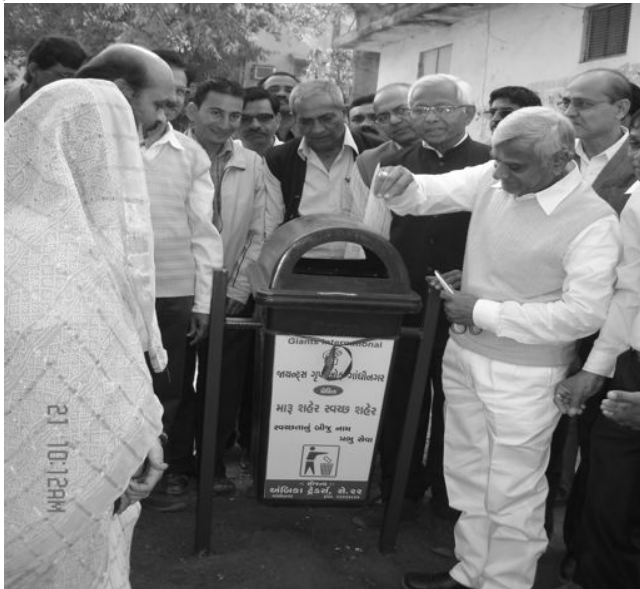
Inauguration of MY CITY CLEAN CITY project.

Gandhinagar. 56 bottles of blood were collected and given to Civil hospital, Gandhinagar to be used for needy patients during emergencies. * Dustbins were installed at different places of Gandhinagar city under Group's "MY CITY CLEAN CITY" project, in the presence of Municipal Commissioner of Gandhinagar Mahanagar Palika and other dignitaries.