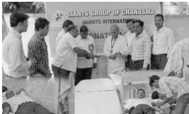
At a Blood donation camp.

in local hospitals & nearby areas. * Blood Donation camp was organized, wherein 52 bottles of blood were collected for the use of needy patients during emergencies.