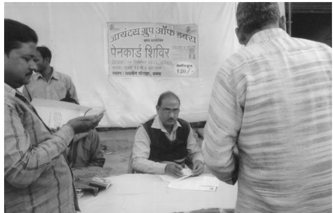
Pan Card distribution camp in progress.

A person never forgets two faces: First who “HELPS” him in a critical situation and Second who “LEFT” him in a critical situation.