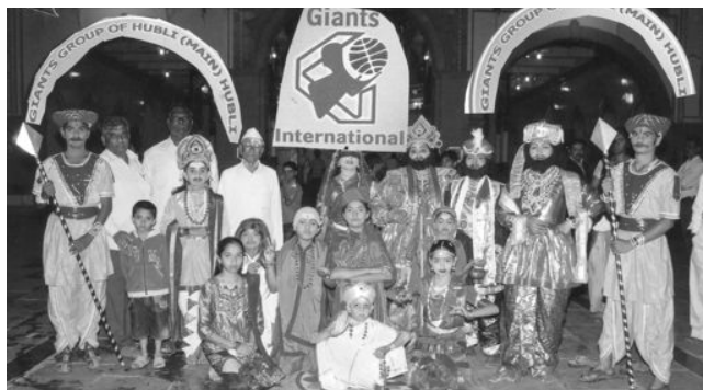
District Utsav programme.

followed by moral support to the Anti-Corruption movement started by Social activist – Shri Anna Hazare jointly with Smt. Gangubai Hangal Foundation.