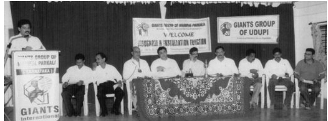
Inaugural programme of GIANTS Group of Manipal Parkala.

bearers. * Blood Donation camp was held, wherein 21 bottles of blood were collected in association with K.M.C. Hospital, Manipal & District Govt. Hospital, Udupi.