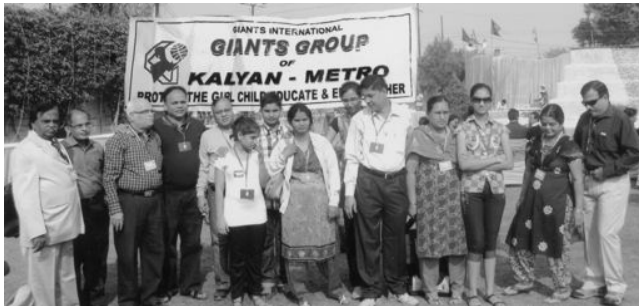
Members at 37 th Annual Convention at Mathura.

given. * 28 Members along with Young GIANTS Members attended the 37 TH GIANTS International Convention held at Mathura and won Outstanding