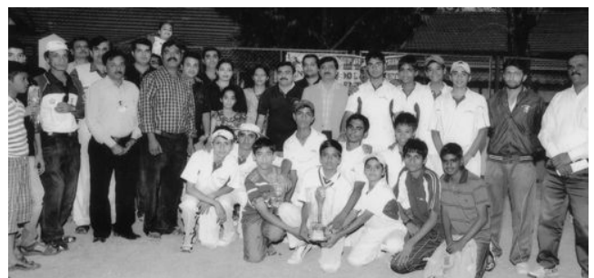
Members with the Winners of Inter School Cricket Tournament.