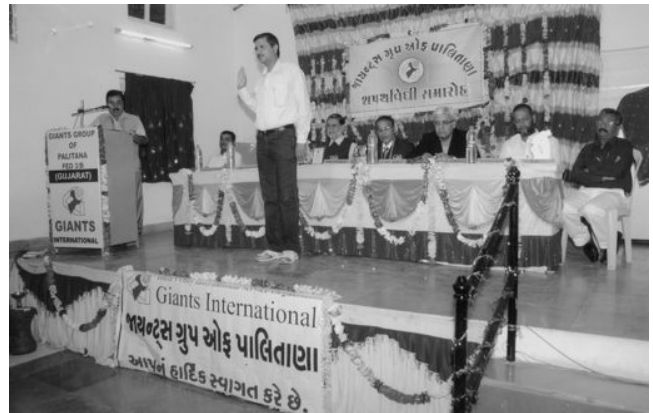
Incoming President receiving oath of office.

2012, along with his team of Office Bearers. Many Group Members, who rendered their yeomen services during the year 2011, were honoured on this occasion.