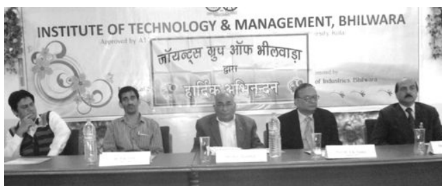
Dignitaries on dais during a Seminar.

about 'the importance of having an effective personality and developing sound knowledge'. * Members attended the 37 th GIANTS International Convention held at Mathura in the month of December, 2011.