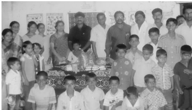
Sweets & snacks distribution project in progress.

people about the cause of density of calcium in bones followed by a checkup programme. Calcium tablets were distributed to needy patients.