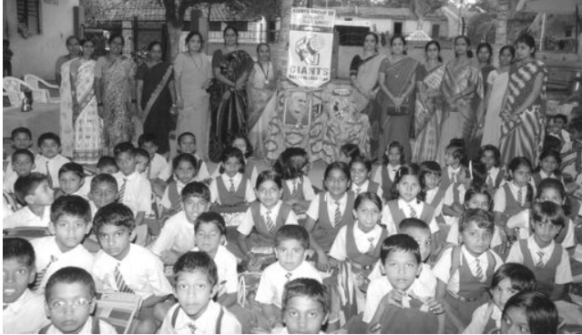
Children’s Day celebration.