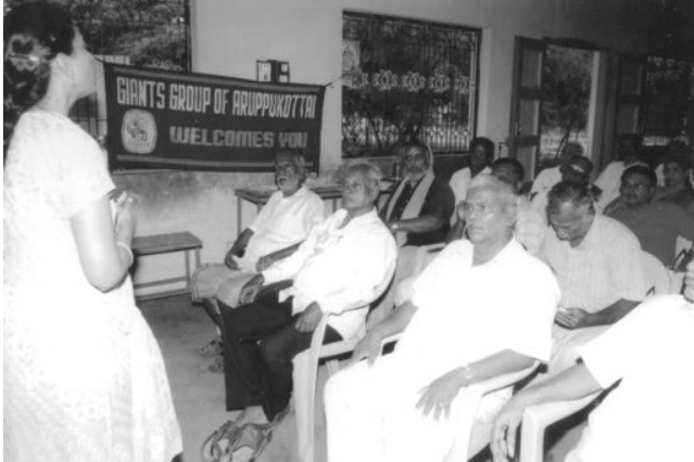
Pranic Healing camp in progress.

methods. Many Group members as well as Members of Virudhunagar District Tamilnadu Retd. Govt. Employees Association participated.