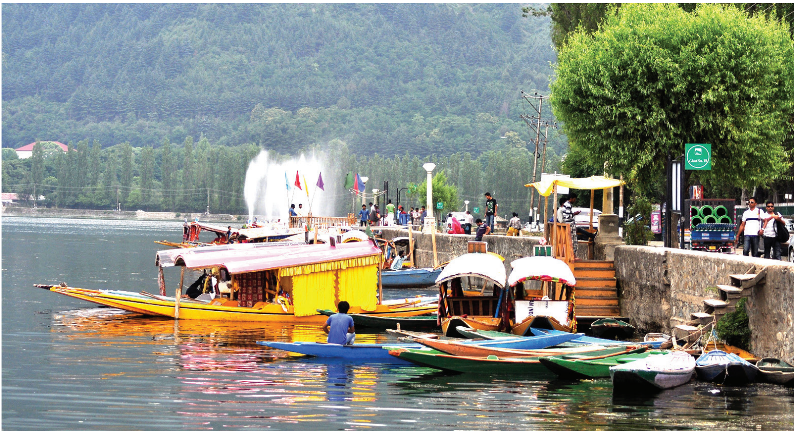
A bunch of boats on the waterfront of the world famous Dal lake in Srinagar, Kashmir. The tourist rush to the Valley of Kashmir is currently on increase.

100 educational centres suffer as government fails to pay annual maintenance contract