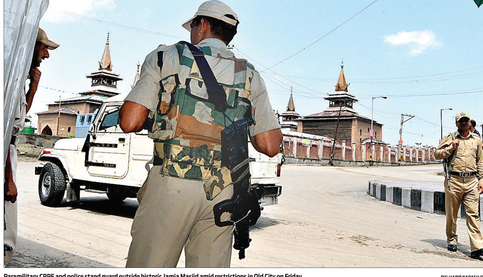
Paramilitary CRPF and police stand guard outside historic Jamia Masjid amid restrictions in Old City on Friday.

DIPK-3147 SD/- District Sheep Husbandry Office